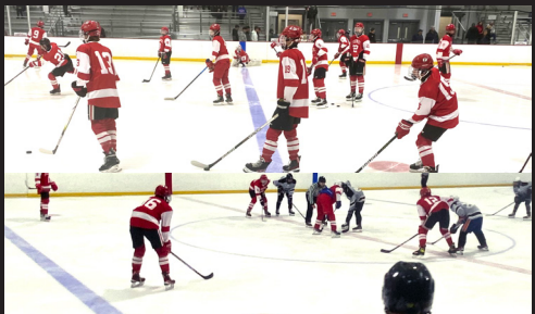
1st Boys & Girls Hockey Team Takes the Ice!