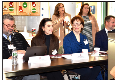
Thank You! Legislators & LAC