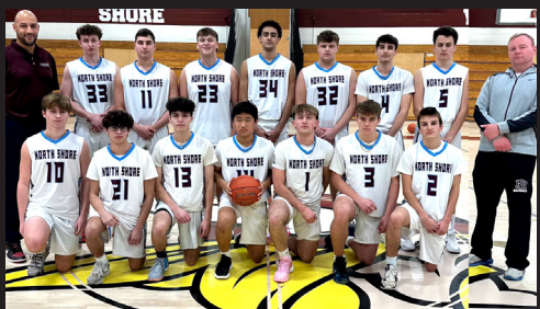
Boys BB Team - County Finalists