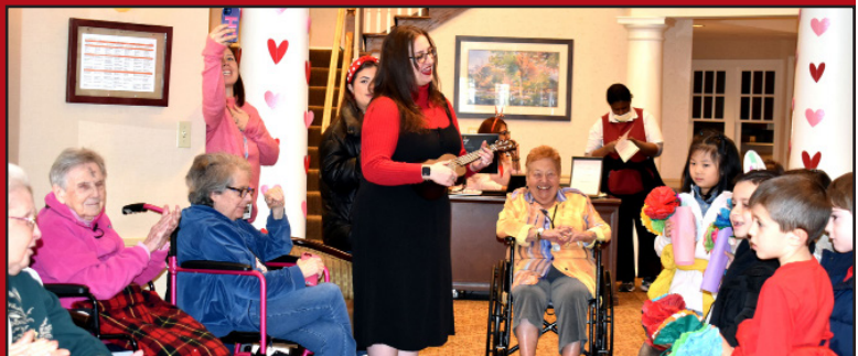
GWL Students Visit Sunrise Assisted Living Facility