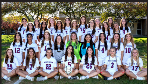
Girls Soccer Team - County Semi-Finalists