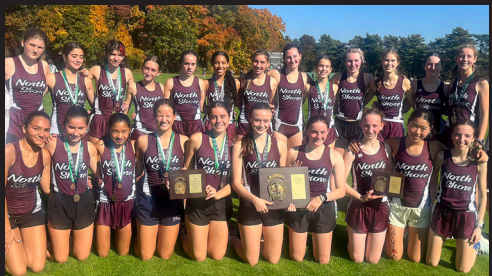
Fall Girls Cross Country Team - County Champs!